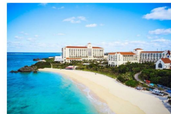
Nikko Hotels International has obtained the "SAKURA QUALITY An ESG Practice" certification, a standard recognized by the GSTC. (Left: Grand Nikko Tokyo Daiba, Right: Hotel Nikko Alivila/Yomitan Resort Okinawa)