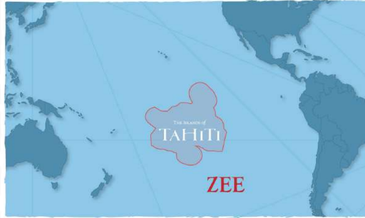
Exclusive economic zone reserved for polynesian fishing fleet