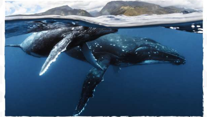
Largest marine sanctuary in the world