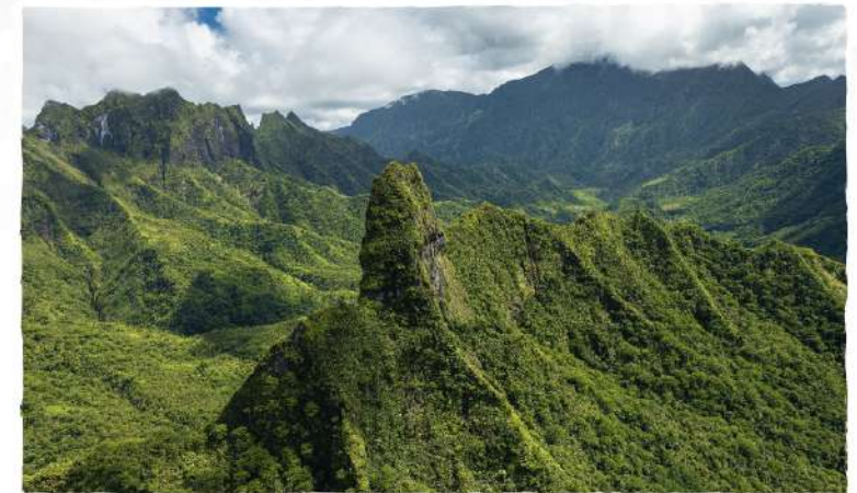
Primary forest protection association