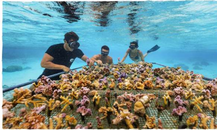
Coral reef restoration