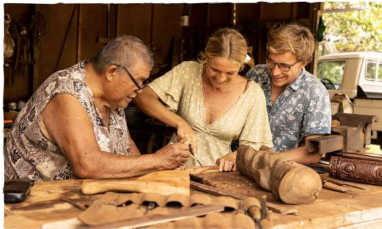
Community and cultural engagement