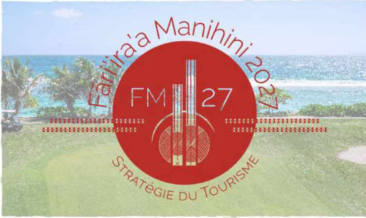
One of the leaders in sustainable tourism