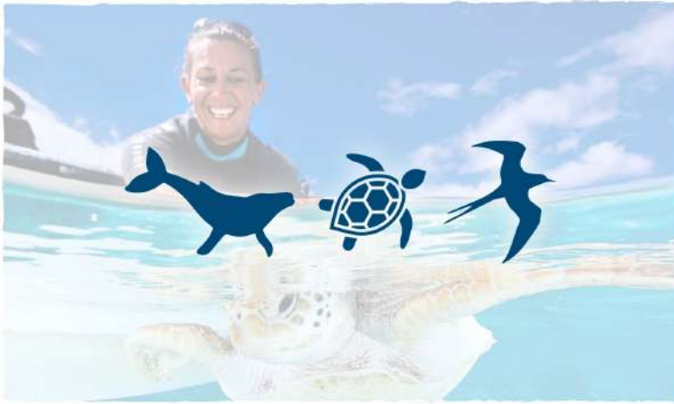
Wild life protection