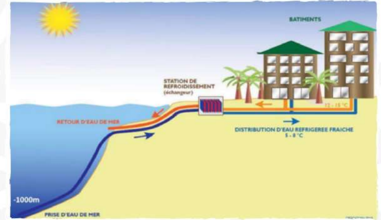
Deep Sea Water Air Conditioning System (SWAC)