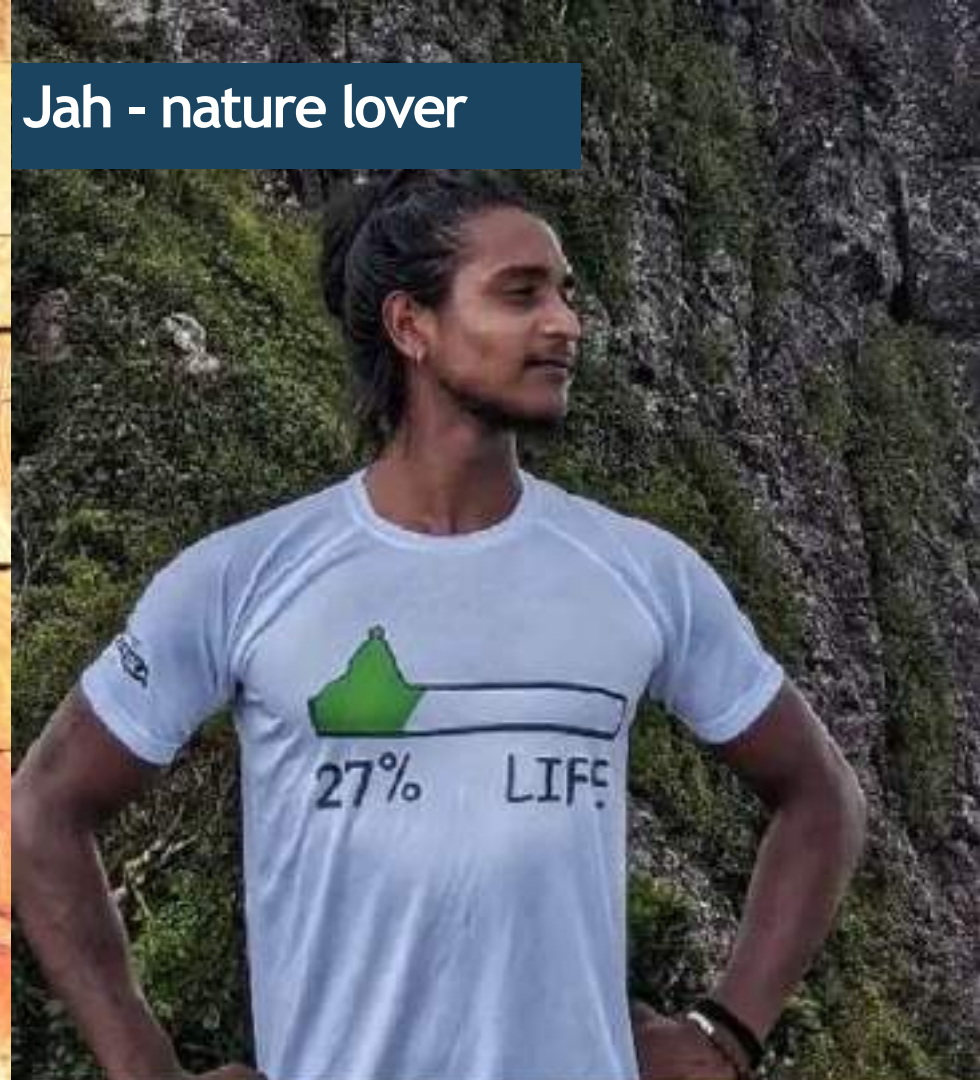
Jah - nature lover