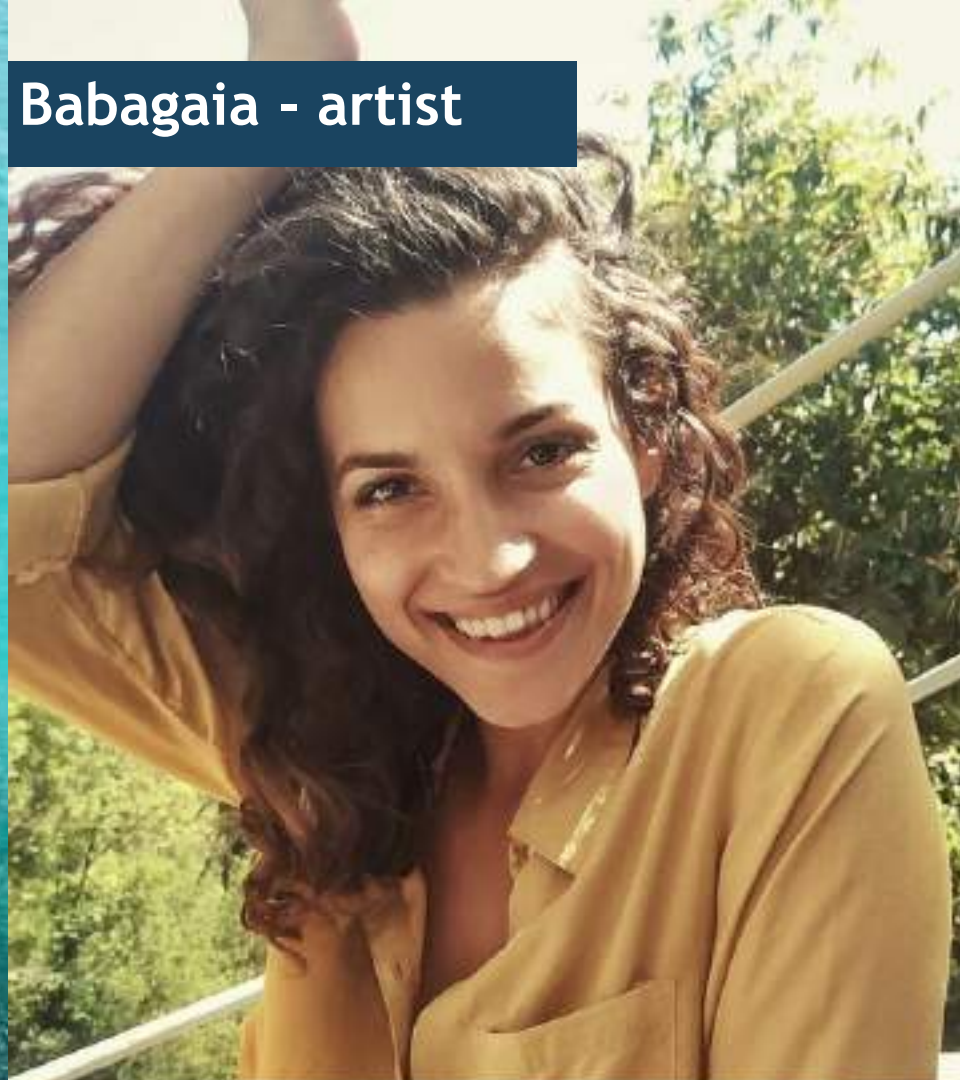
Babagaia - artist