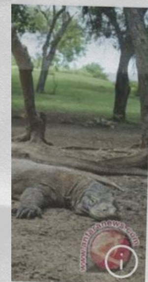
iranus ational Park, in January 17, 2018.